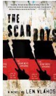
The Scar Boys by Len