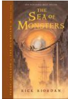
The Sea of Monsters by